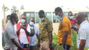
Training of Trainers on germplasm conservation and use