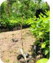
Development of protocols for vegetative propagation of tree crops