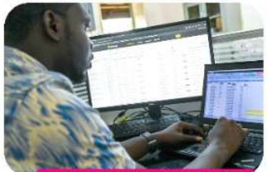
Documentation of germplasm information